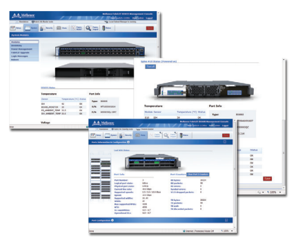
Figure 1. Sample Screenshots †

The move to modern datacenters is driving new and dynamic operation models. Onyx provides operators with a wide range of tools to address these needs, including enhanced parsing, dynamic pipeline control, and enhanced OpenFlow implementation to enable numerous SDN deployment models. In addition, Onyx supports Docker containers, which enable software to be run in isolation, full SDK access, faster and secure delivery of customized applications, and more.