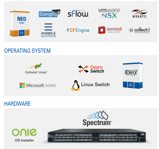
Figure 1. Open Ethernet Operating System and Hardware